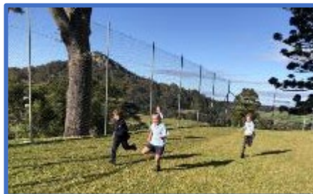
Here we are practising running in lanes for our athletics carnival.

Our item is called the Tilba Farm Polka and children have been practising hard – or as hard as they can with our classroom out of action due to it being painted and various absences due to illness! All children have been involved in the choreography of our dance performance and costumes are well underway. Massive thanks to Linda for stepping in and helping out with our cow tails. xx