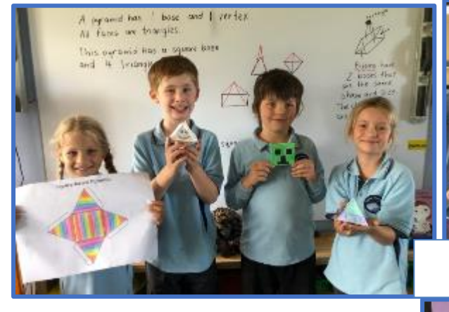
Year 4 teamwork in action when constructina 3D obiects.