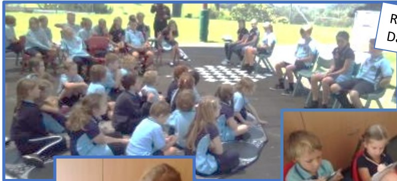
Remembrance Day assembly