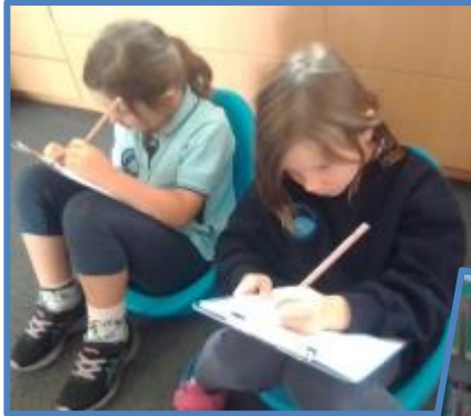
Year One did their spelling in the scoopy seats this week.