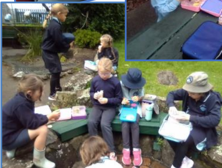
Eating together at fruit break. Such delicious, tasty and healthy lunch boxes!