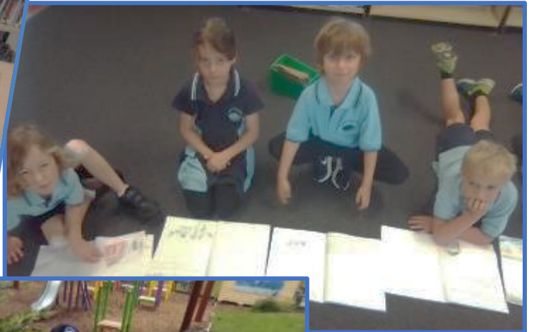
Kinder transition started this week- we happily welcomed our 2022 kinder children. Photos next week.