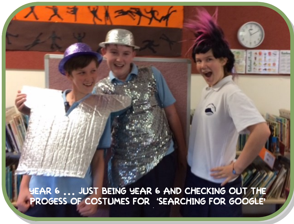
YEAR 6 ... JUST BEING YEAR 6 AND CHECKING OUT THE PROGRESS OF COSTUMES FOR 'SEARCHING FOR GOOGLE'