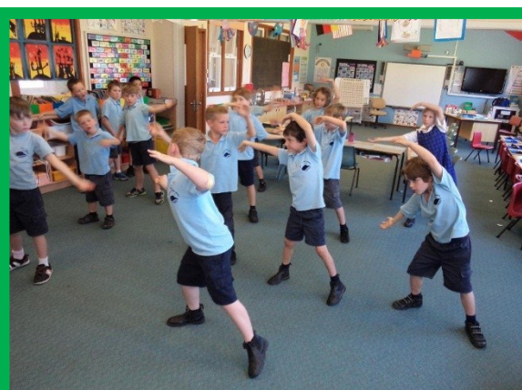
Meanwhile .. the Infants Class got on with the job of rehearsing for 'Imaginations'